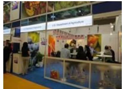
U.S. Exhibitors Lounge