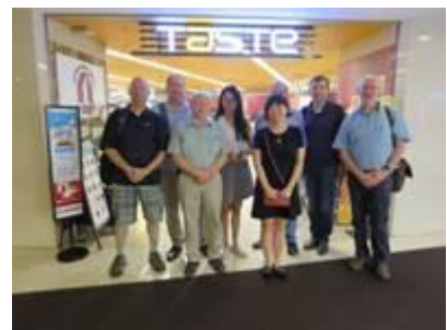
Tour of Food Retail Market