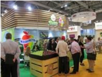
U.S. Pavilion at the show