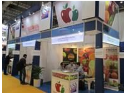
U.S. Pavilion at the show