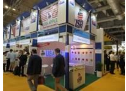
U.S. Pavilion at the show