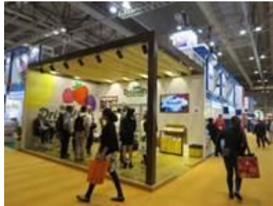
U.S. Pavilion at the show