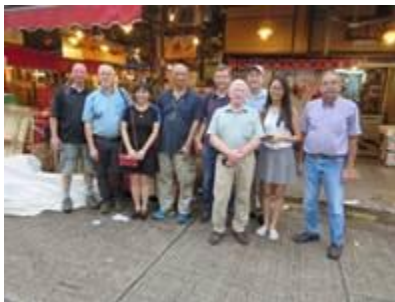
Tour of Wholesale Market