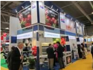
U.S. Pavilion at the show