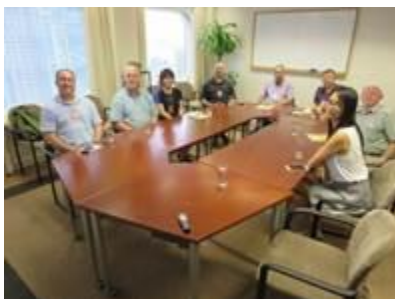
Market Briefing at ATO HK